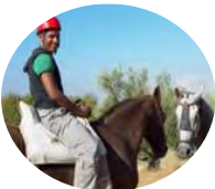
ride a horse

Classify the sports into ball & individual sports: